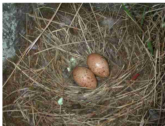
Sclater's monal eggs in the nest

Eggs We measured the two eggs in the nest and marked them on the shell with a pencil. The eggs measurements were as follows: