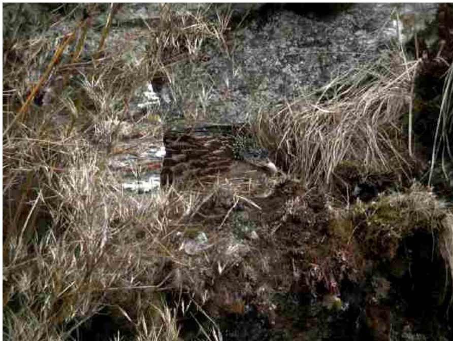
Female Sclater's monal incubating in the nest