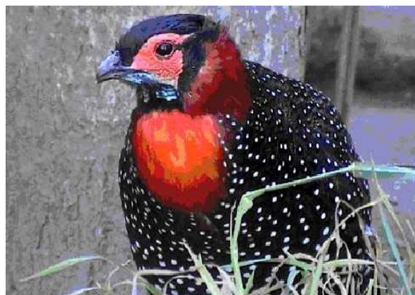
Western Tragopan male at Sarahan Pheasantry, Himachal Pradesh

to see some of the wild pheasants that live in the area.