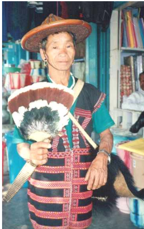
An Idu-Mishmi tribal (Arunachal Pradesh, India) with a fan made from Sclater's Monal tail feathers