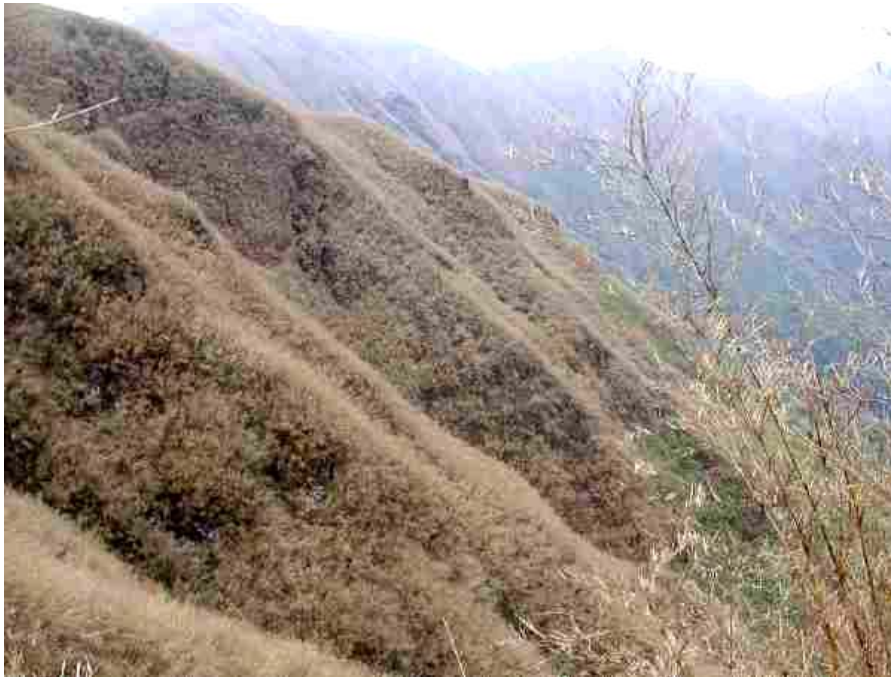
Nesting habitat of Sclater's monal