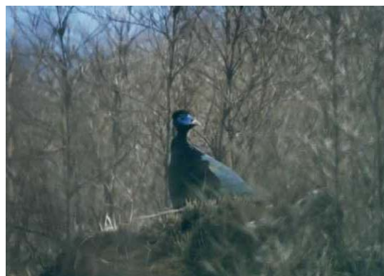
A Sclater's monal male